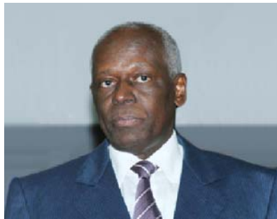
Angolan President José Eduardo dos Santos