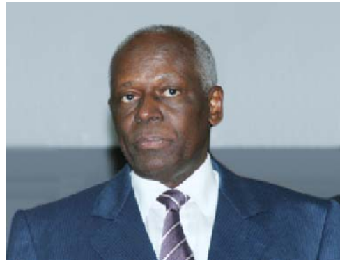
Angolan President José Eduardo dos Santos