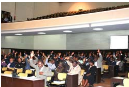
National Assembly approves government`s request to update 2008 State`s Budget

The Angolan National Assembly (Parliament), gathered in the capital city, passed the government`s request to update the State`s General Budget (OGE) for 2008, aimed at responding to the expenditure relating to next September`s parliamentary polls.