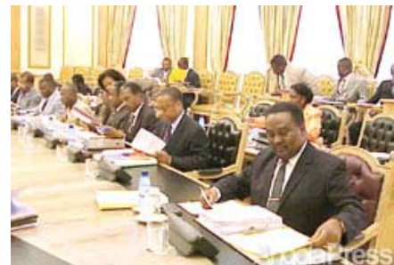
Government authorises public company ENDIAMA

The International Gold Exploration firm has the capacity to mobilise financial resources for the programmes of prospecting and search of ores.